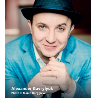
Alexander Gavrylyuk