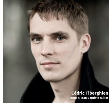
Cédric Tiberghien