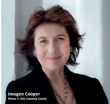
Imogen Cooper

We are thrilled to introduce you to the new Leeds International Piano Series – a natural offshoot of the Leeds International Piano Competition. This, we believe, is the first time that Leeds has presented its own international piano series.